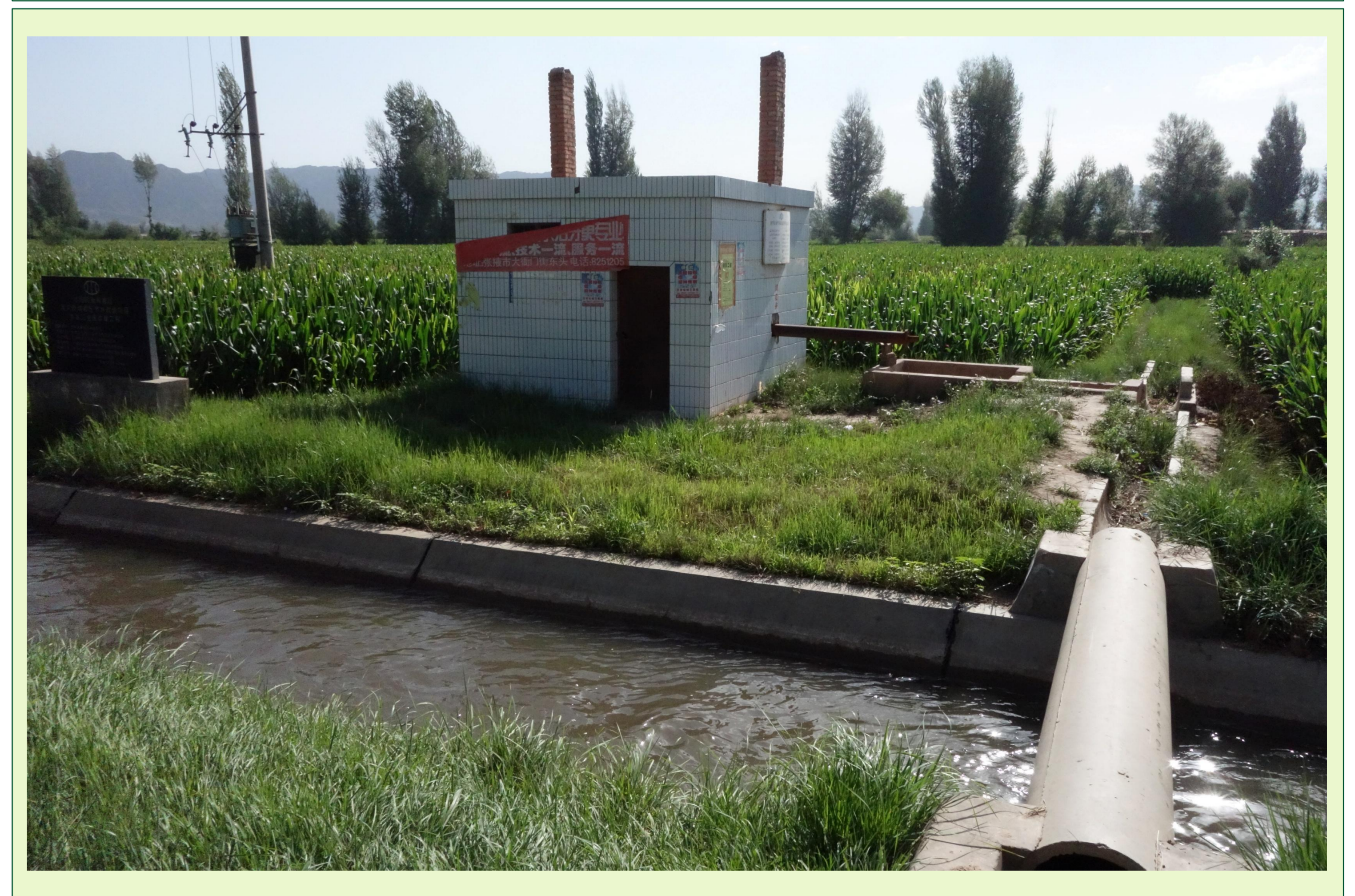
Groundwater pump next to surface water canal in Hei River Basin.

We could proof a strong dependency between farmers' groundwater use and the surface water supply in our study area. At the same time, we observe that farmers who pump groundwater are used to farming practices which require a lot more water than practices by farmers who rely on surface water only. This difference in farming practices makes it unlikely to achieve real water savings (accounting for both surface water and groundwater) by modifying the surface water supply only. Restrictions on land expansion and policies to propagate low water demanding, drought resistant crops may be necessary to avoid unsustainable (ground-) water use. Nevertheless, a more balanced distribution of surface water in the study area may have a soothing effect on farmers' excessive groundwater use in specific locations and could also increase farmers' acceptance regarding possible groundwater use restriction policies.