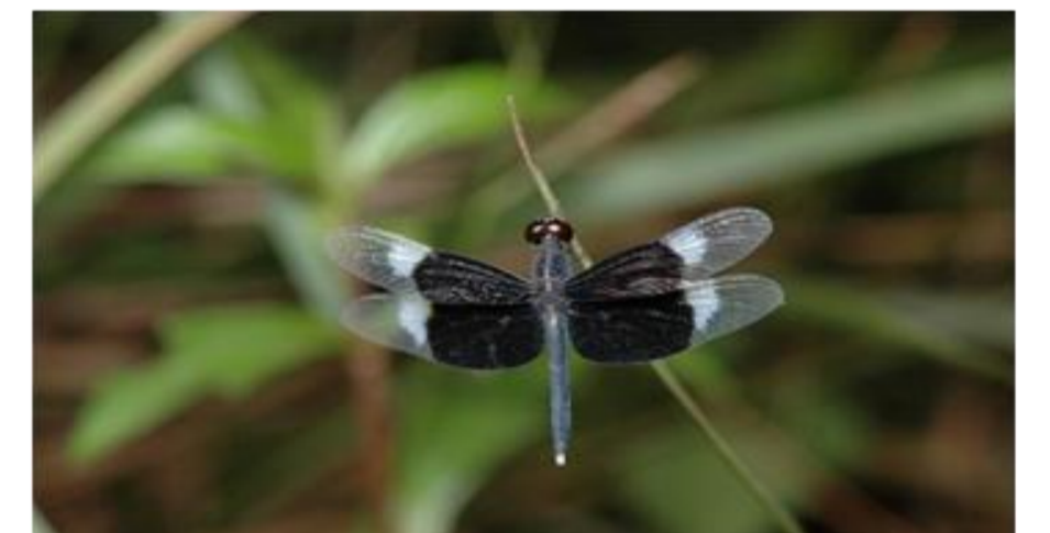
The dragonfly ( Neurothemis tullia ) has large group in pond.

Landscape Scenery: ponds provide scenery to residents live in the neighborhood.