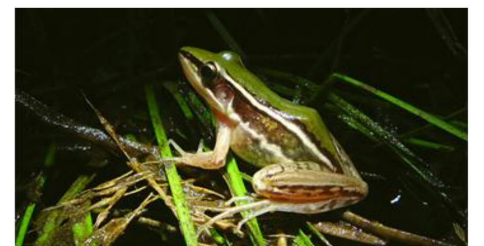
Taipei frog ( Rana Taipehensis ) is a protected species in pond.